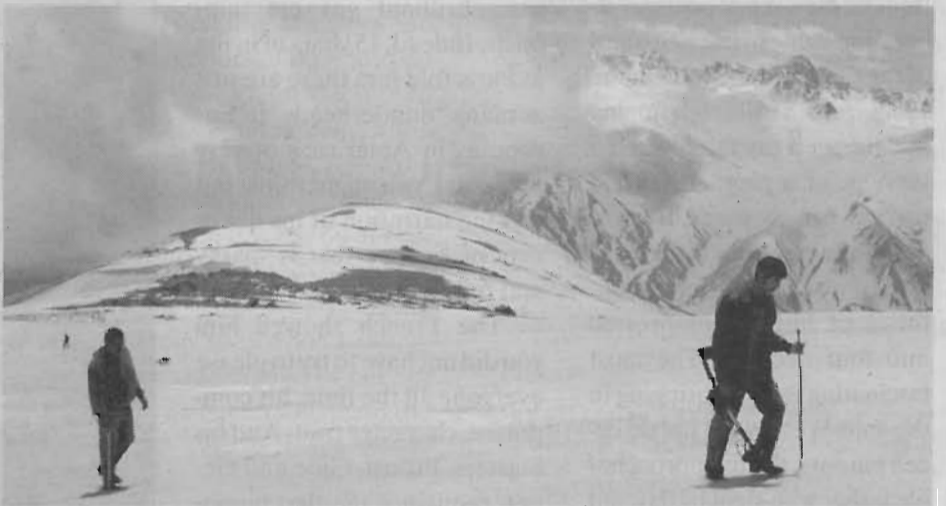
This year's festival reaches the lofty summits of the Himalayan Mountains