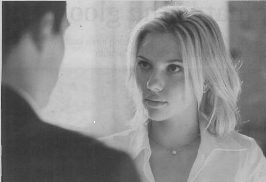
Actor Scarlett Johansson is the femme fatale lead in Woody Allen's "Match Point"